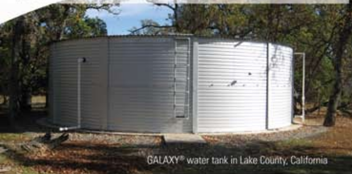
GALAXY® water tank in Lake County, California

The GALAXY® range of water tanks is a cost-effective water storage solution which is the result of years of continuing research and development and state-of-the-art manufacturing technology. GALAXY® tanks can be designed to suit extreme weather conditions. All GALAXY® domestic tanks come with the exclusive 5-layer Aqualiner® approved to the American NSF Standard for contact with potable water. Backed with a conditional 10 year warranty, our GALAXY® tanks are designed to meet your budget without compromise in quality.