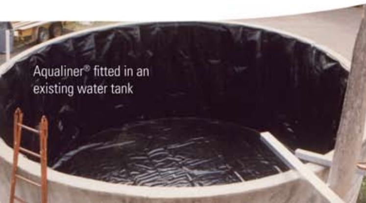
Aqualiner® fitted in an existing water tank

Rejuvenate your leaking tank by fitting a custom manufactured Aqualiner®. Our Aqualiner® can be tailor made to fit tanks of any size or shape.