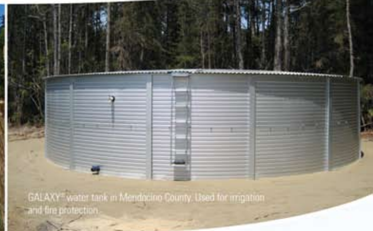
GALAXY® water tank in Mendocino County. Used for irrigation and fire protection.

A typical GALAXY® tank kit is less than 1% of the installed size, making transportation of your new GALAXY® tank - even to the most remote places easy. GALAXY® tanks are quick to install and only require a small installation footprint.