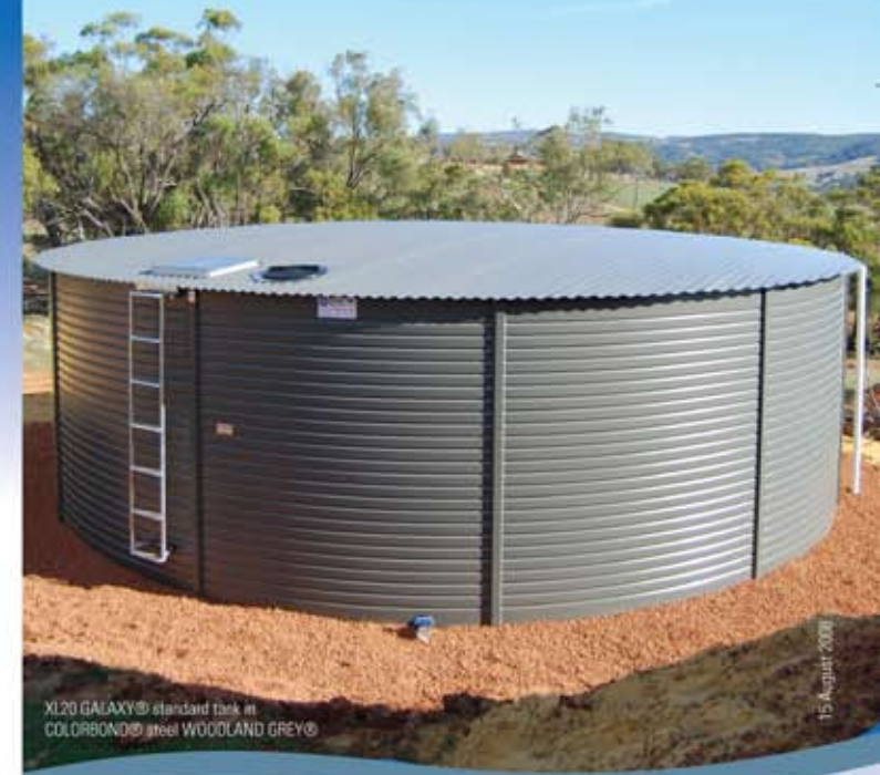
XL20 GALAXY® standard tank in COLORBOND® steel WOODLAND GREY®