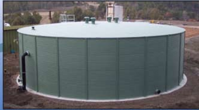
GALAXY® 194,000 gallon water tank installed in La Plata County Colorado. Stores well water and Brine as part of a commercial application.

One of GALAXY® tanks' best selling points is its versatility. Not only has it proven its worth in rural and ranch applications, it has established the same reliable reputation in the industrial and commercial workplace.