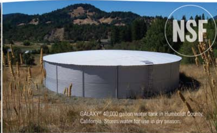
GALAXY® 40,000 gallon water tank in Humboldt County, California. Stores water for use in dry season.

The GALAXY® water tank is engineered with safety and durability in mind. The unique 8/80 V-Lock wall panels absorb earth movement while allowing the panels to be bolted together using fully enclosed bolt strips. This results in a tamper proof, safe, reliable and aesthetically pleasing water storage unit.