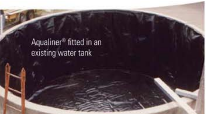
Aqualiner® fitted in an existing water tank

Rejuvenate your leaking tank by fitting a custom manufactured Aqualiner®. Our Aqualiner® can be tailor made to fit tanks of any size or shape.