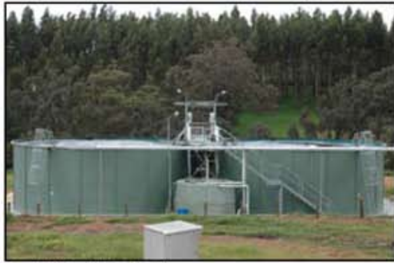
Boundary Wines, Western Australia. Bio Mass Tanks.

One of GALAXY™ tanks' best selling points is its versatility. Not only has it proven its worth in rural and ranch applications, it has established the same reliable reputation in the industrial and commercial workplace.